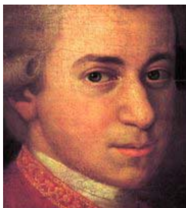
Wolfgang Amadeus Mozart 1756-91.

Some of you will have heard me talking about the benefits of listening to music by Mozart - for helping you to learn and also to help you to relax. Some of you even have the CDs and have tried it and know that it seems to work!